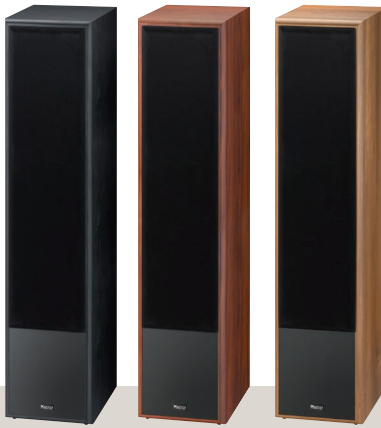
Gehäusefarben in schwarz, kirsche und Nussbaum Cabinet surface in black, cherry and walnut