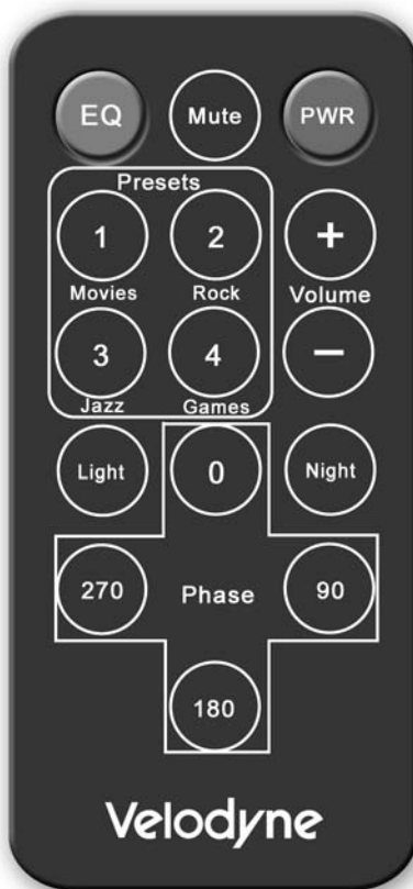
Figure 3. Remote Control

NOTE: The SPL-Ultra remote can be attached magnetically to the back of the subwoofer in the upper left hand corner.